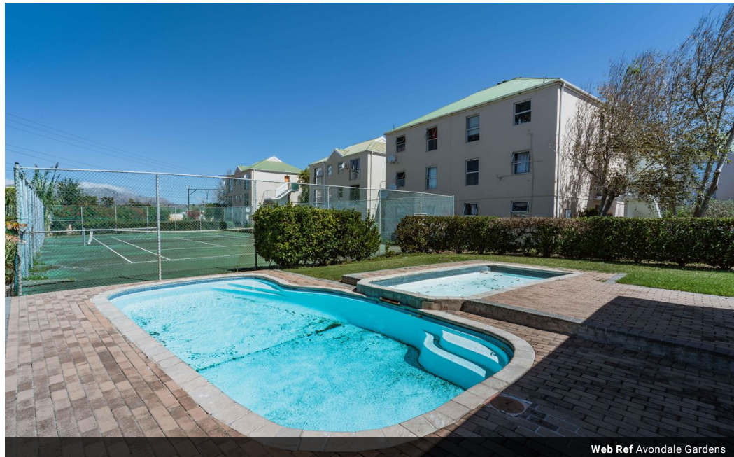
Web Ref Avondale Gardens

5th Floor The Terraces 25 Protea Road Claremont Cape Town