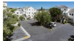
Property Sales Statistics June - November 2022