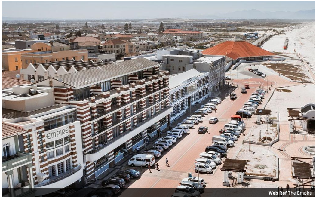
Web Ref The Empire

5th Floor The Terraces 25 Protea Road Claremont Cape Town