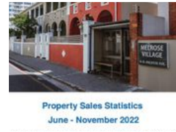
Property Sales Statistics June - November 2022