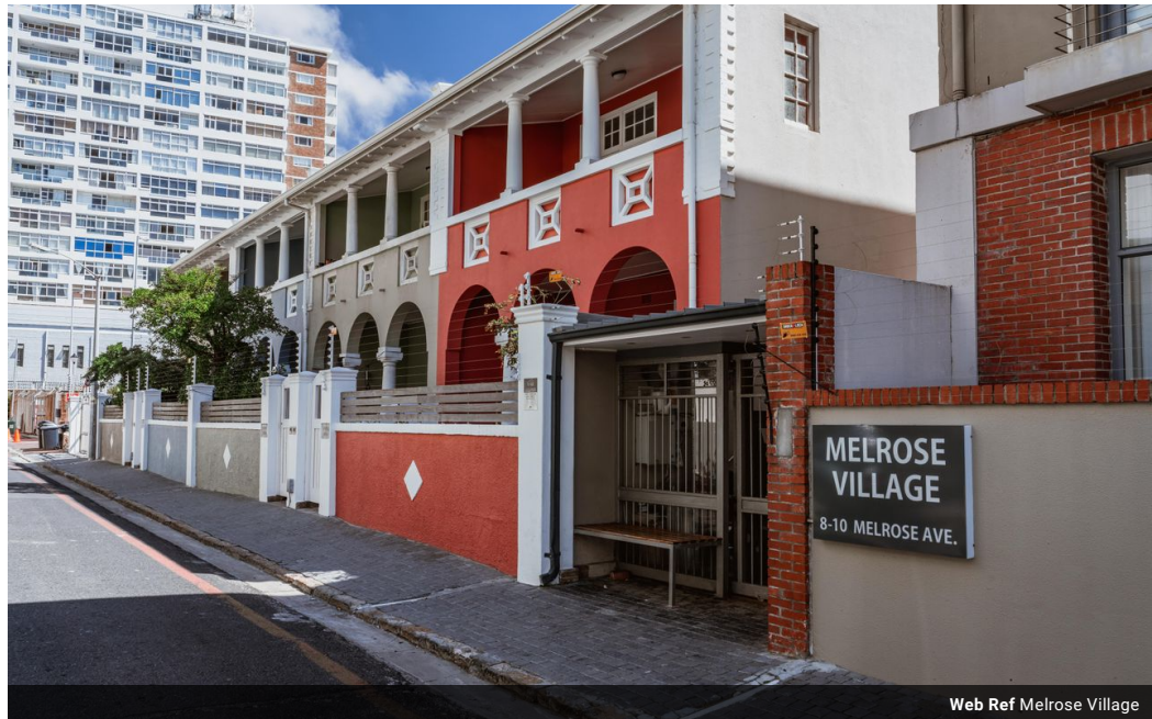
Web Ref Melrose Village

5th Floor The Terraces 25 Protea Road Claremont Cape Town