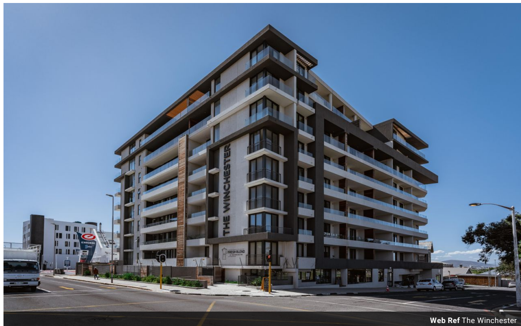
Web Ref The Winchester

5th Floor The Terraces 25 Protea Road Claremont Cape Town