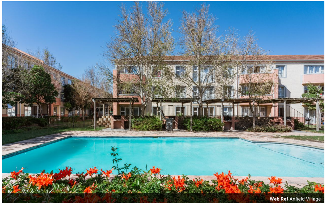
Web Ref Anfield Village

5th Floor The Terraces 25 Protea Road Claremont Cape Town