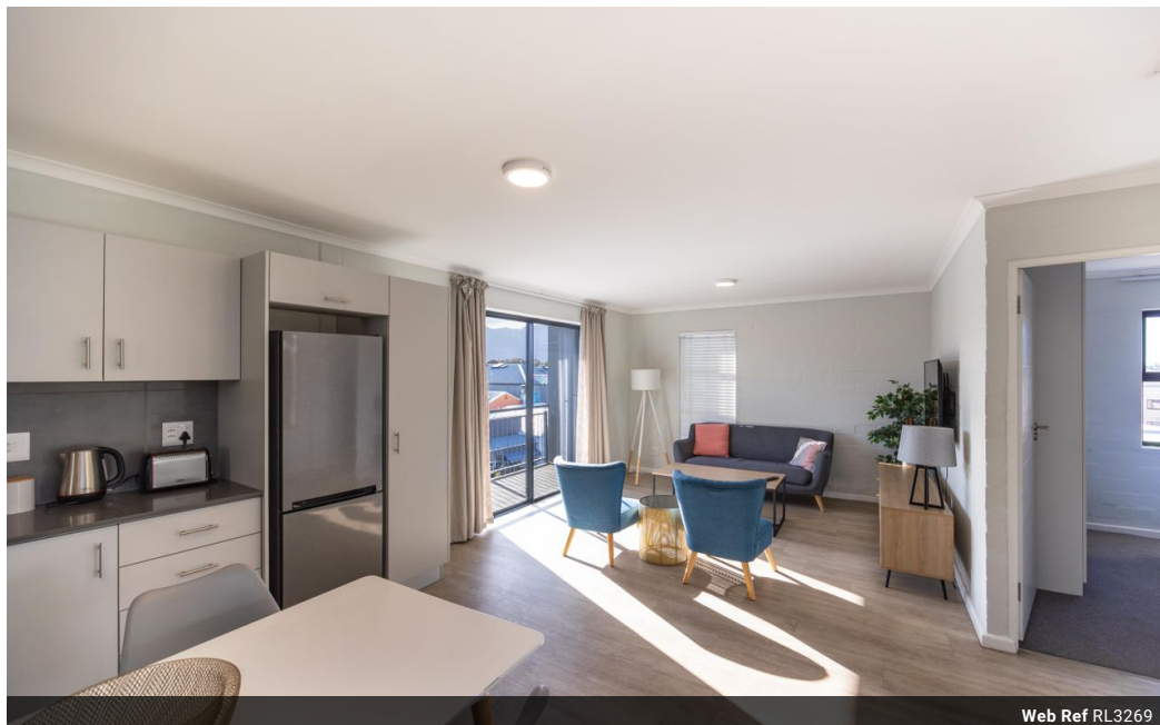
Web Ref RL3269

5th Floor The Terraces 25 Protea Road Claremont Cape Town