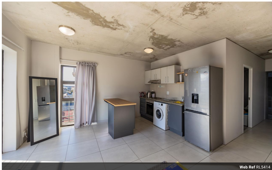
Web Ref RL5414

5th Floor The Terraces 25 Protea Road Claremont Cape Town